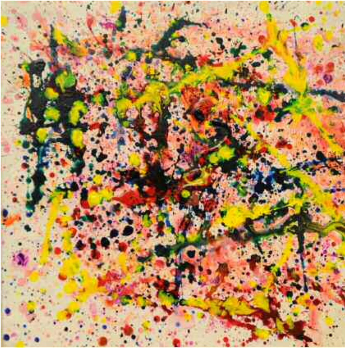
Original oil painting by Ridley Lassiter, recent OSB graduate. The painting, part of the OSB art show, was purchased by one of the guests.