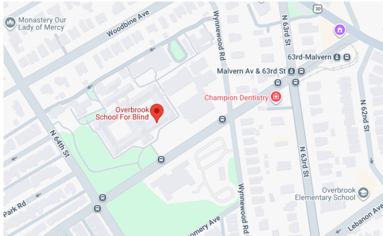
Map view of nearby public transportation stops around Malvern Avenue, Wynnewood Road, and 63rd Street.