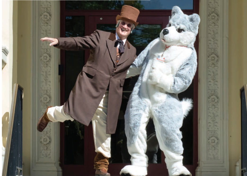
Having some fun with the OSB Huskie on History Day.