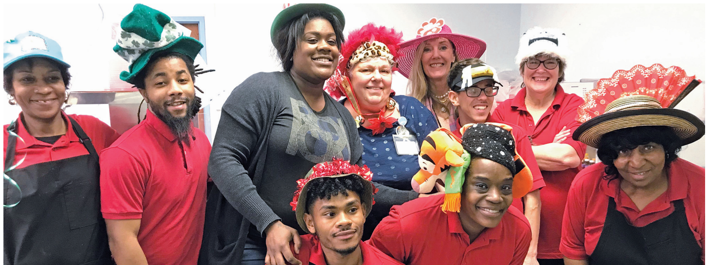
Our students weren't the only ones dressed up for Spirit Week. Here's the lunchroom staff decked out in their finest for Crazy Hat Day .