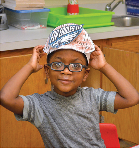
On Monday, it was Philadelphia Sports Team Day which was easy to do since the Philadelphia Eagles had just won the Superbowl!

This annual OSB tradition encourages students to wear a fun and funky array of clothes with a different theme for each day of the week.