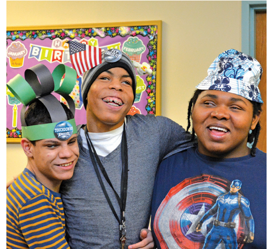
Later in the week we celebrated Crazy Hat Day .