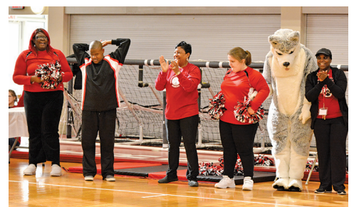
On Friday we donned OSB gear for Red and White Day which included a Pep Rally full of cheers, contests and games.