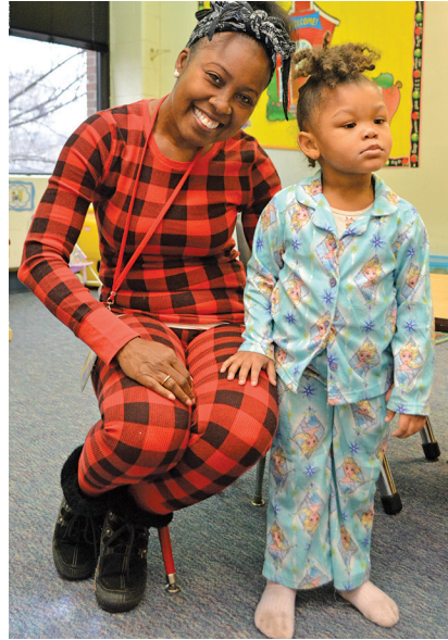
We rolled right out of bed on Tuesday for Pajama Day .