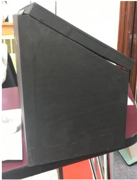
Side view of CVI Shape Sorter to display the angle and working area.