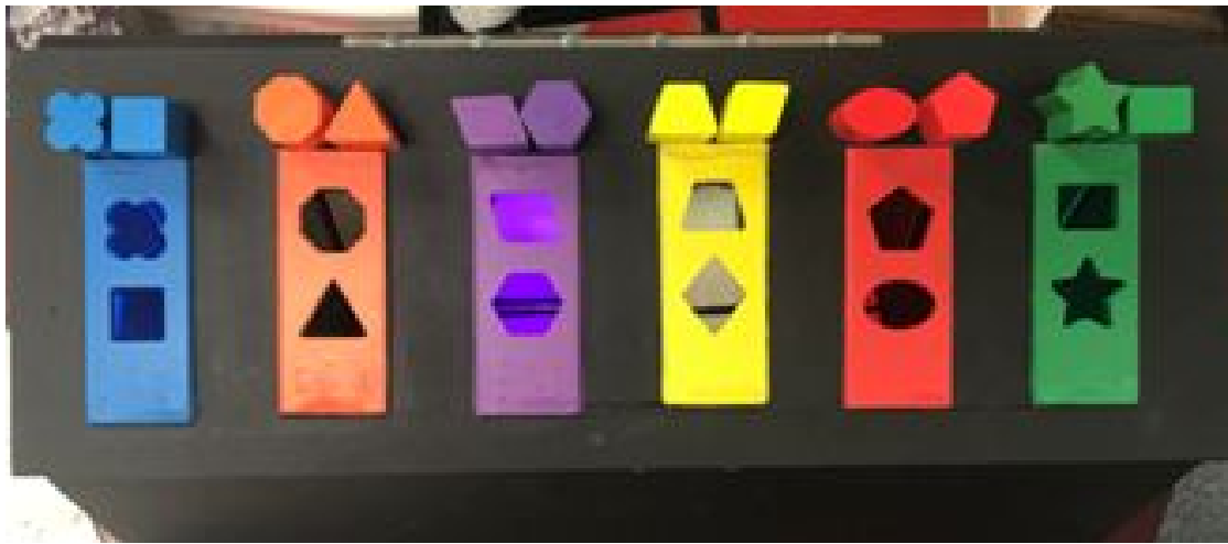
Top View of CVI Shape Sorter with shapes above corresponding openings and matching colors.