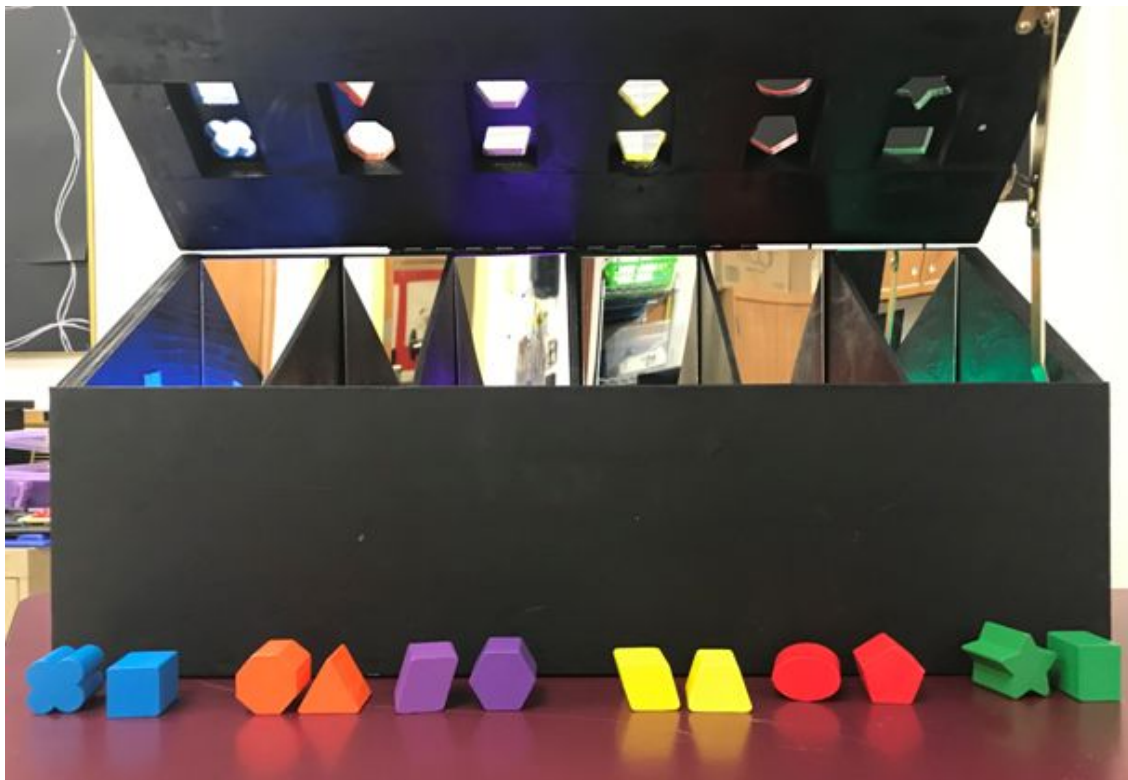
Front View of CVI Shape Sorter with Lid propped open to display reflective mirror surface and shapes in front.